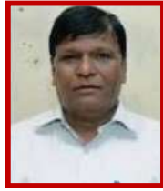
Hon. K. B. Malusare