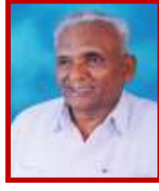
Hon. Ganpatrao Deshmukh