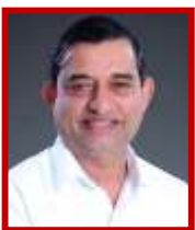
Hon. B. D. Patil