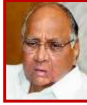
Hon. Sharadchandraji Pawar