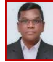
Hon. K. D. Ratnaparakhhi