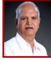
Hon. Adv. B. N. Shinde