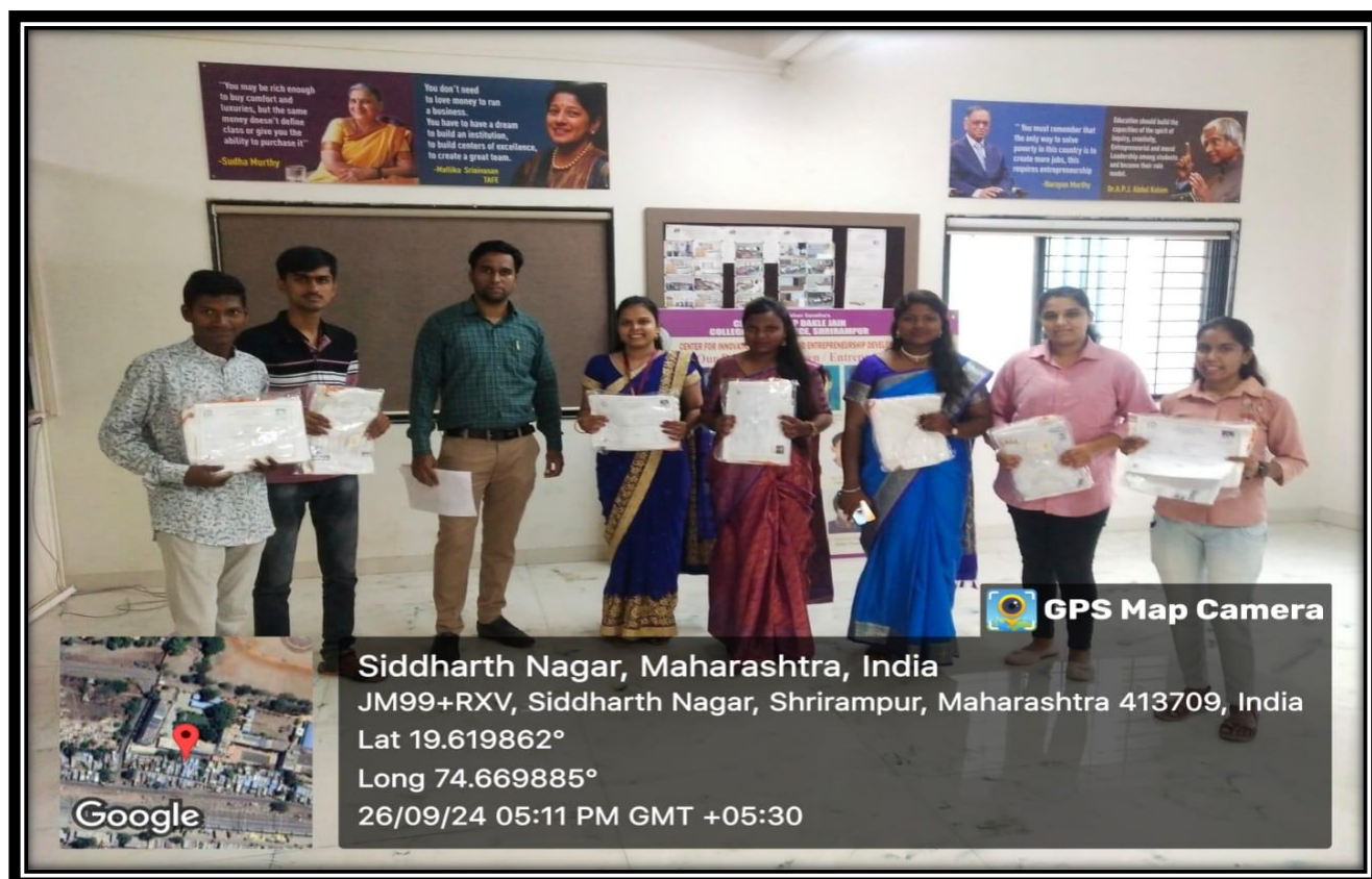
Students with their PMKVY Kit