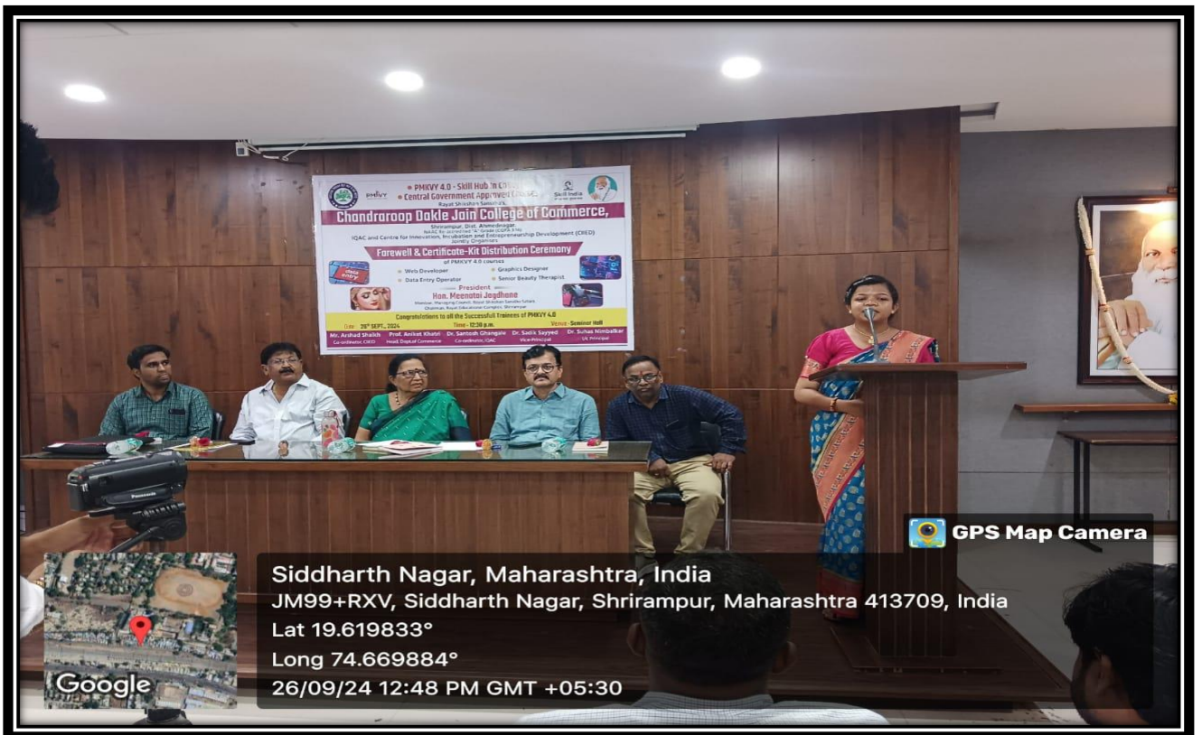
Students at presenting their Feedback