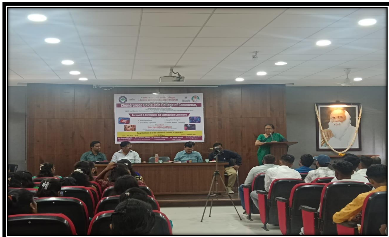
Hon. Meenatai Jagdhane delivering the presidential speech