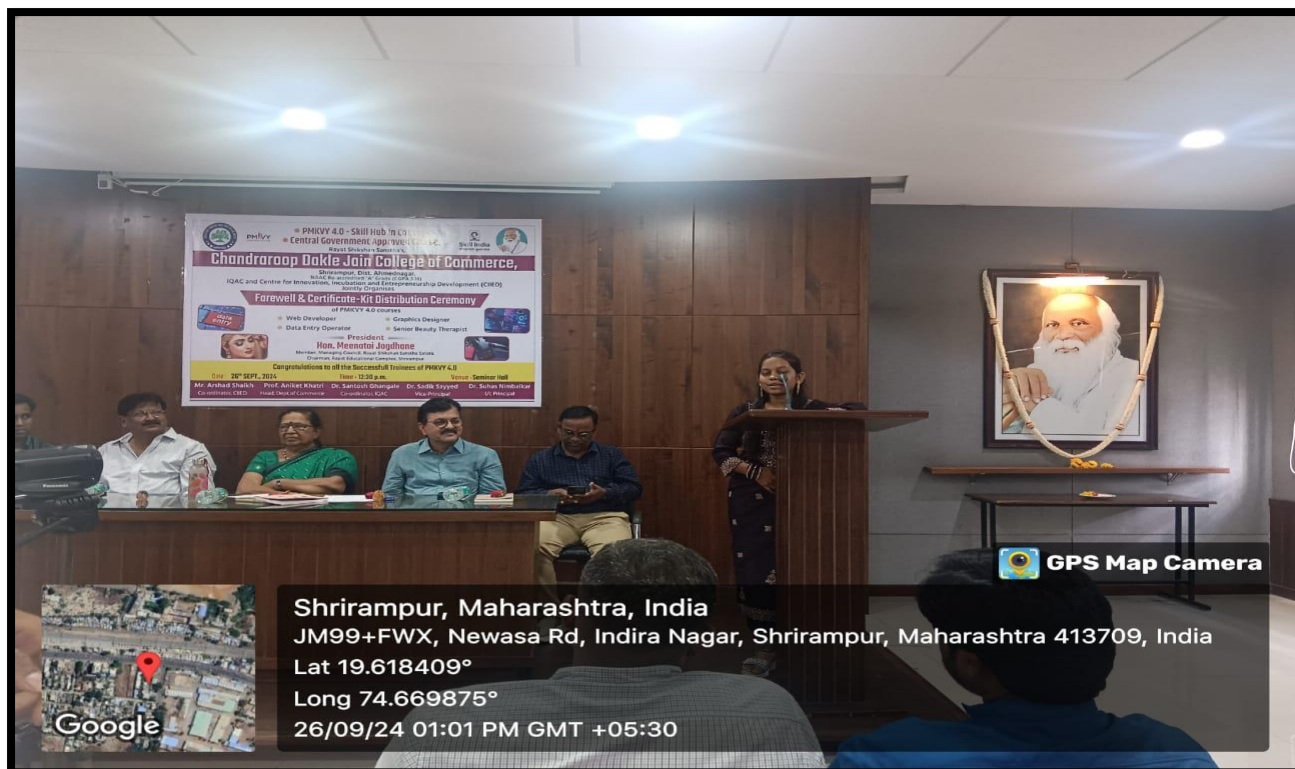
Students at presenting their Feedback