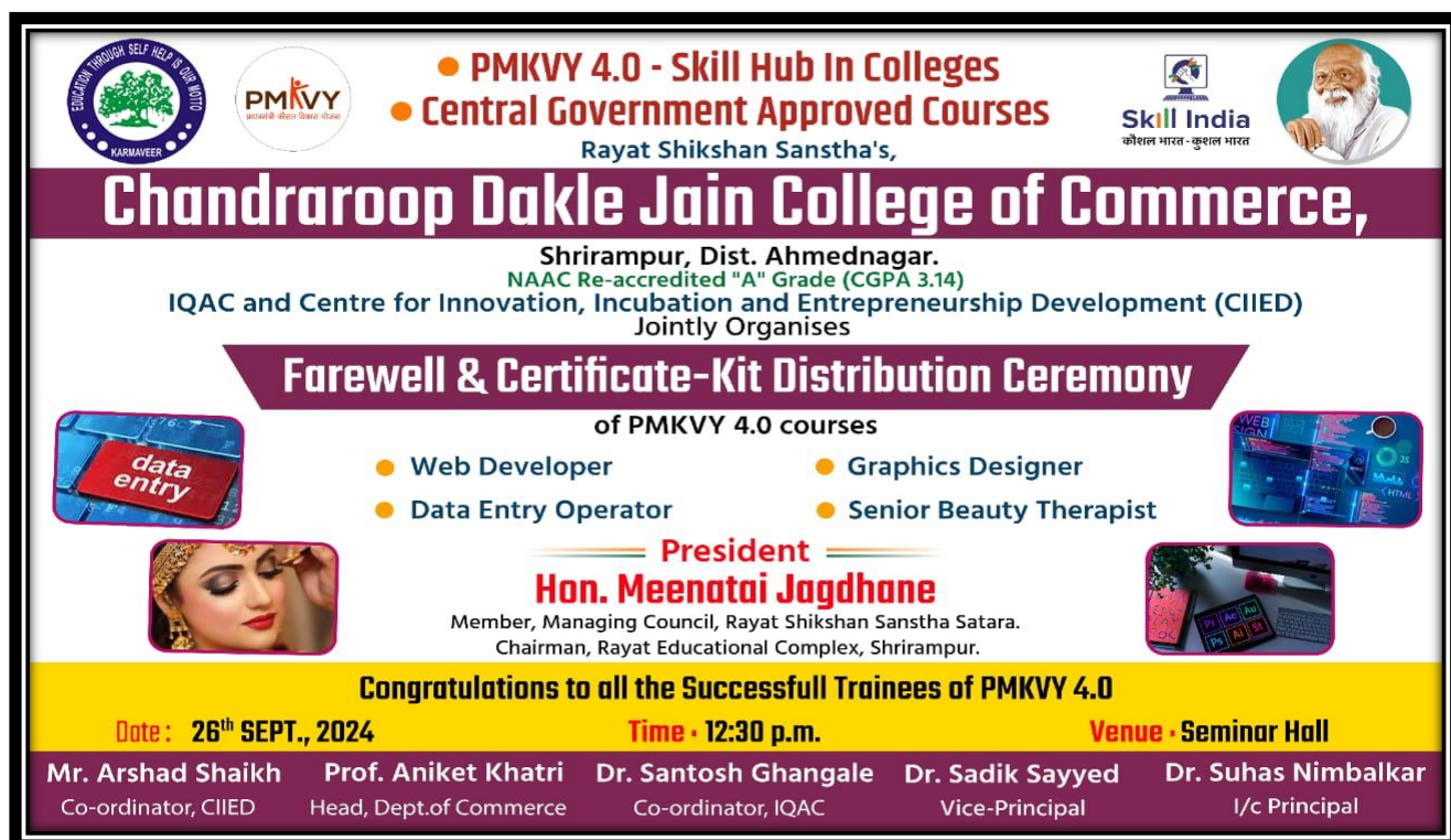
Flyer of the Programme