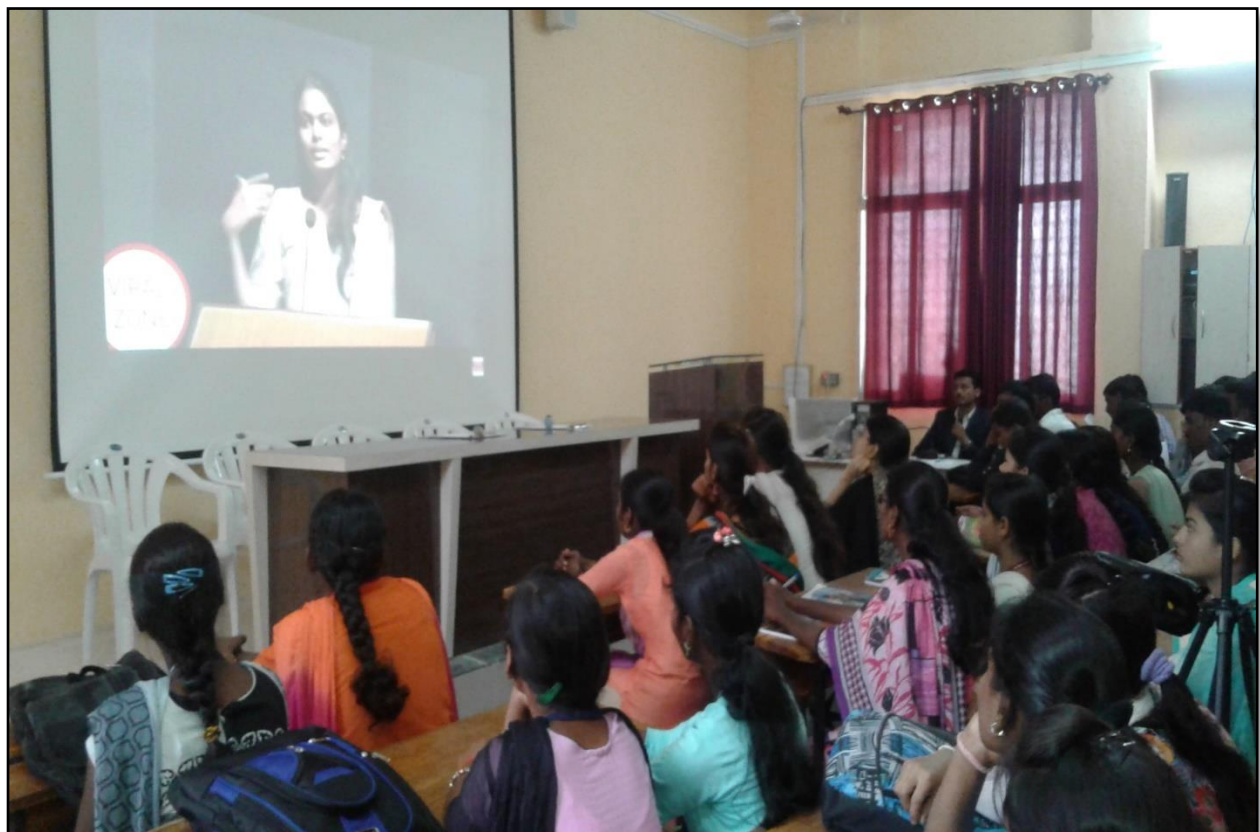
Students watching the English movie for learning pronunciation (Film Screening)